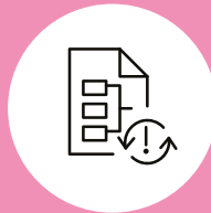
Multiple Points of Data Integration