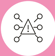
Multiple Points of Maintenance

Despite their “integrations,” using these distinct point solutions for financial data quality, financial close & consolidation, reporting and budgeting planning & forecasting often dilutes the user experience for Finance teams at large, sophisticated organizations. The fragmented nature of these products has created extra work and costs that simply make it hard for organizations to take finance further. In fact, rather than spending analyzing the business, many finance teams are forced to spend time managing the following: